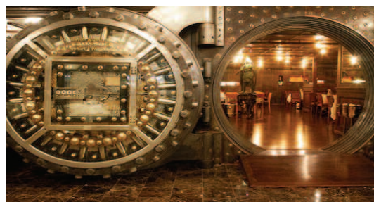
*Bobby Vans Bank Vault Dining Room

Our annual Thanksgiving Eve, Eve dinner will be held at Bobby Vans downtown in their famed vault room. The event will begin promptly at 6PM on Tuesday, November 20 th and will include your choice of Filet Mignon, Chicken or Fish (you'll have plenty of turkey on Thursday!). We will have a 3 hour bar including unlimited beer, wine and soda. This sit-down meal will of course include all classic steakhouse sides, salad, dessert and coffee. This event sells out every year, so make sure you purchase your tickets early. The cost of the dinner is $70.